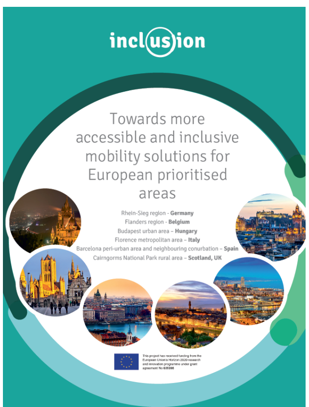
The project's leaflet

The project leaflet introduces INCLUSION to the main target groups and to a wider audience. The leaflet will be printed and an electronic version will be available for download from the website. The leaflet aims to inform a wide audience about the project's objectives and expected results. It will also provide more details about the INCLUSION activities. The leaflet will be used for distribution at the European, national and local levels by all project partners.